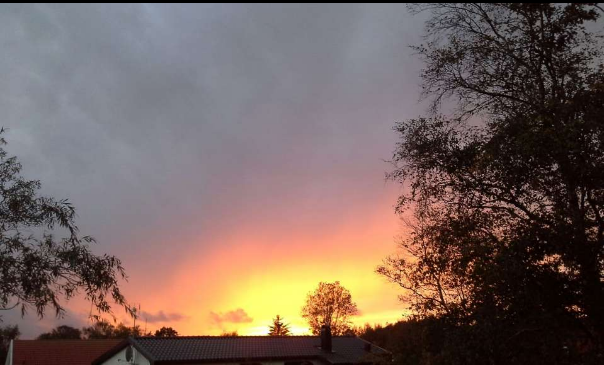
Sweden Late Summer 2015