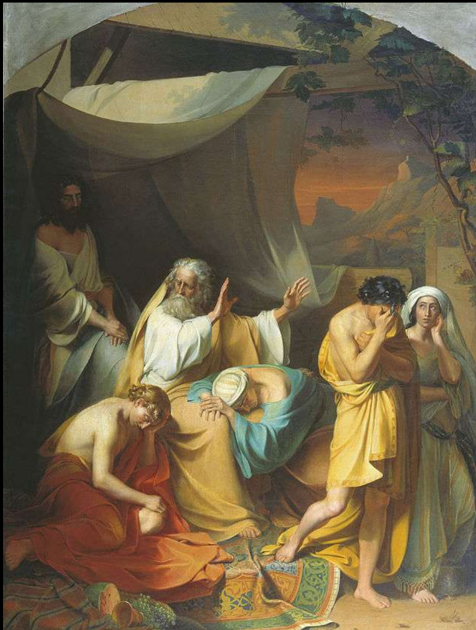
Noah damning Ham, 19th-century painting by Ivan Stepanovitch Ksenofontov