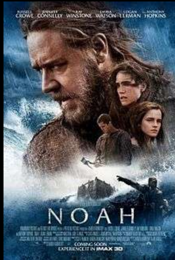
Noah (Film 2014)