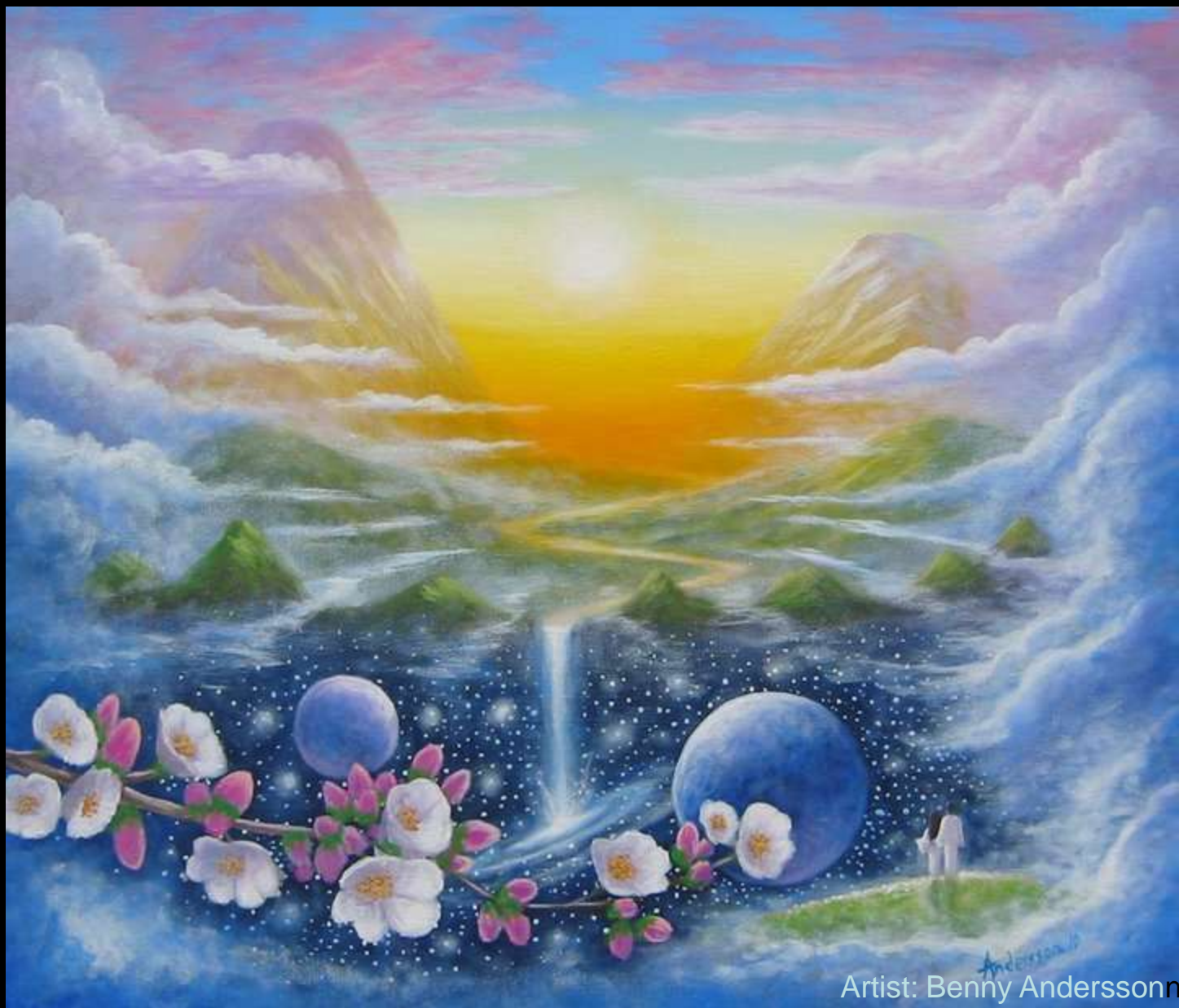
Artist: Benny Andersson